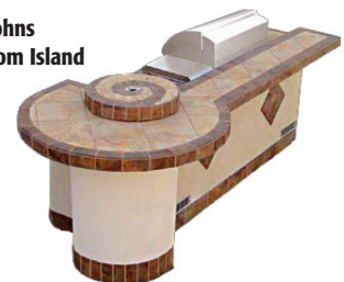
St. Johns Custom Island