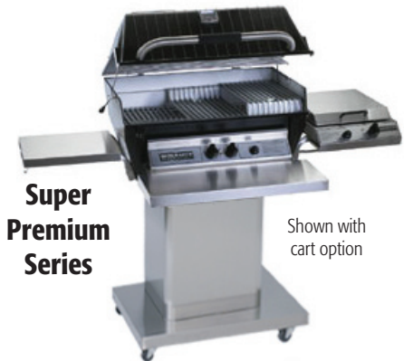
Super Premium Series