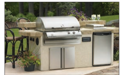
St. Martin Custom Islands

Shown with optional upgraded 36i cook number and tumbled marble counter-top.