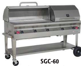
SGC-60 shown with optional 24" and 36" smoke hoods