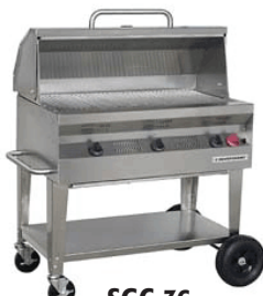
SGC-36 shown with smoke hood option

Available in Natural Gas or Propane configurations. Comes with hose and regulator (regulator on LP models only). Specify fuel type when ordering.