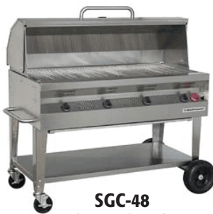
SGC-48 shown with smoke hood option