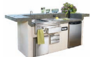
Oasis Cocktail Custom Island