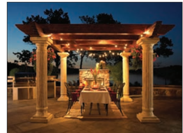
Tuscany Pergola (shown furnished)