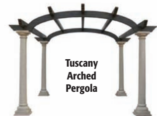
Tuscany Arched Pergola