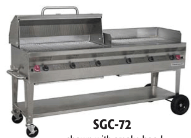
SGC-72 shown with smoke hood and wind guard option