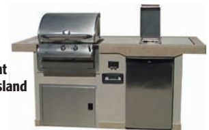
St. Vincent Custom Island