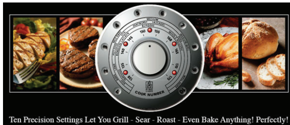
Ten Precision Settings Let You Grill - Sear - Roast - Even Bake Anything! Perfectly!